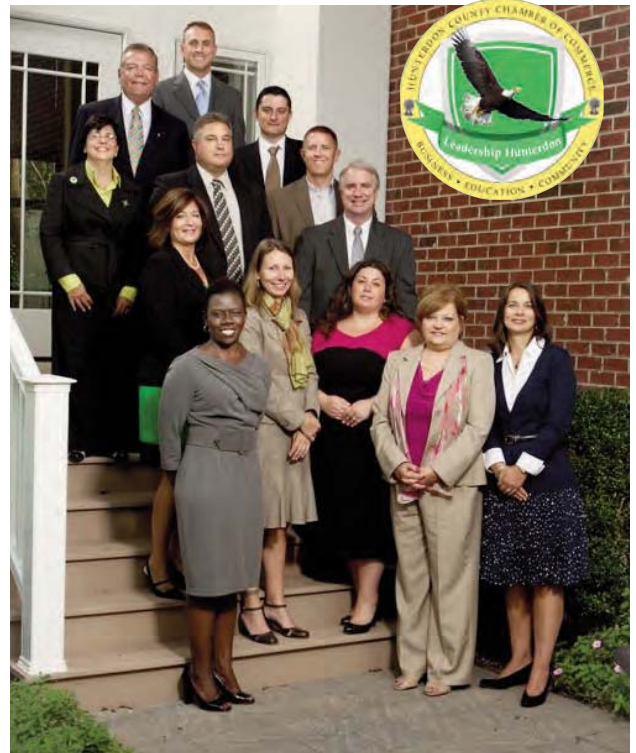
2013 Leadership Hunterdon Class